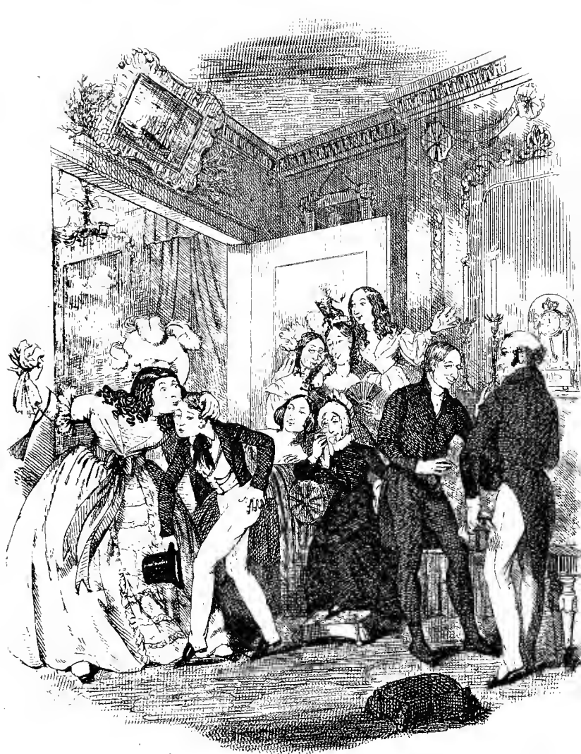
Affecting interview between M lle Donagou.